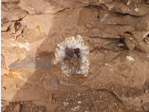
outing 2013 Amethyst Geode (left), Fossils (right)

The second communiqué including the program have been distributed to all registered participants by the Pietermaritzburg Gem and Mineral Club. The exiting program includes various outings for “spinning quartz”, amethyst geodes, fossils, visits to agate dealers and then the tombola and auction at the Gemboree venue.