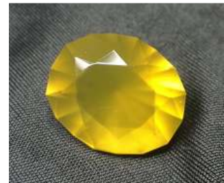
Opal - Madagascar, 9.885 ct, 18x14mm cut by Len Freeman