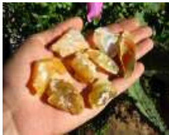
Opal rough - Madagascar

Want to learn how to facet a gemstone like this?