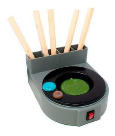
Step 5: Rough grind

You will need a dop pot, dop wax and dop sticks to perform this step. Some dop pots, such as the DopStation shown below, features a handy storage place for your dop wax, dop sticks and other tools.