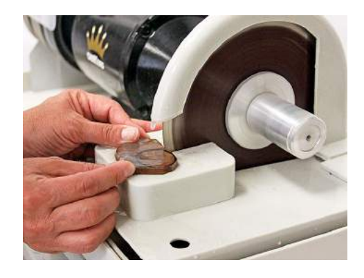
Step 4: Dop (optional)

Now that your cab is outlined, it's time to cut out the shape. Using a trim saw, cut close to the template line. Cut straight lines only, never attempt to cut curves with the saw blade. Allow about a 1mm space around the template line for the material that will be removed during grinding, sanding and polishing. This line is a guide and should still be visible once trimmed. While you trim away the excess material, do so in a manner that will maximize the remaining rough stone. This excess material could be used for other projects, so don't be in a hurry to discard it. Once you are done trimming your cabochon, wash it in warm, soapy water to remove any oil or dirt produced from the trim saw.