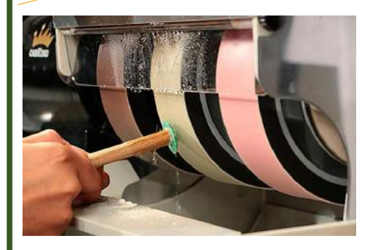
Step 8: Polish

There are many different polishing methods that can be very confusing for beginners. Many cabbing machines come with a polishing kit that is universal and works for most material. That's a good place to start if you're unfamiliar with different polishing agents, methods and pads. The most common polishing agents used in lapidary work are tin oxide, cerium oxide, chromium oxide and diamond paste. These polishing agents are applied to canvas pads, felt pads or leather pads.